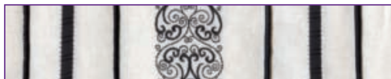
Left to Right: Double-serged Pintuck, Flatlock Stitch with Ribbon, Double-serged Pintuck, Center Embroidery Design, Double-serged Pintuck, Flatlock Stitch with Ribbon, Double-serged Pintuck

The camisole design features embroidery on the front, framed on the right and left with alternating rows of double stitched serger tucks and ribbon woven flatlocking. Rows are positioned 1" apart, measured from the outer left and right sides of the center embroidery on the front. The camisole back does not have center embroidery. Flatlock ribbon weaving is serged at center back, framed by a pair of double stitched tucks, one each on the left and right sides.