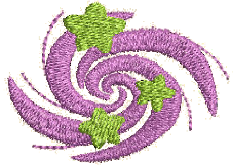
Original design colors

Threads Mode in OESD's Explorations software provides the flexibility to change the colors of a design in several ways. This exercise demonstrates changing individual colors, as well as changing all the colors of a design at once using the Color Wheel feature.