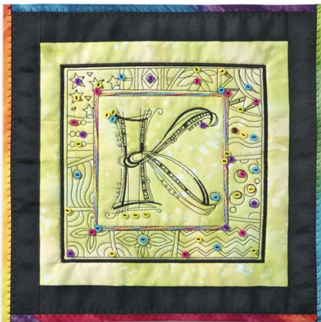
Finished size: 12½" x 12½"

Visit www.berninausa.com for additional projects and information.