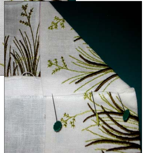
Miter Step 2