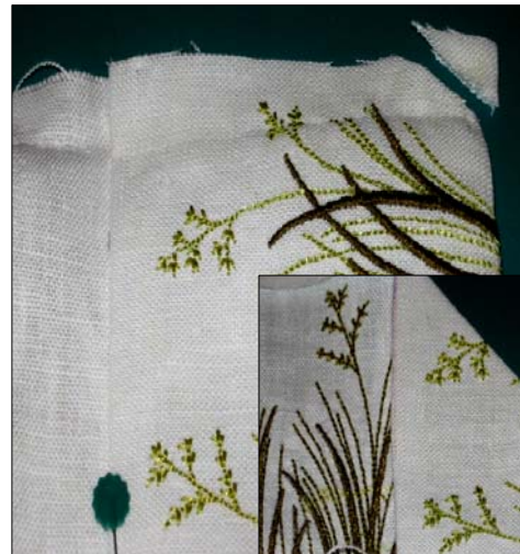
Miter Step 1

Press well, slipstitch the diagonal angles in place. Edgestitch the remaining straight upper edges of all bands using the Edgestitch Foot #10D.