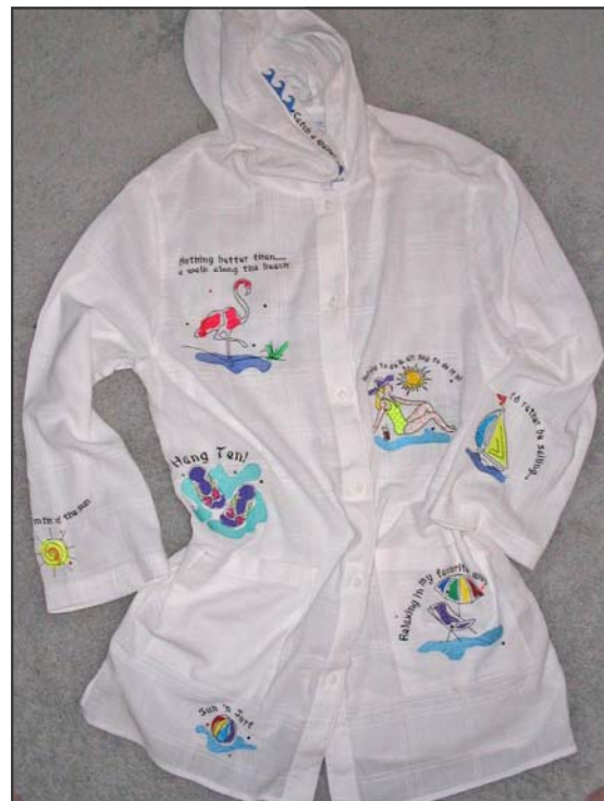
Digitized Beach Embroidery