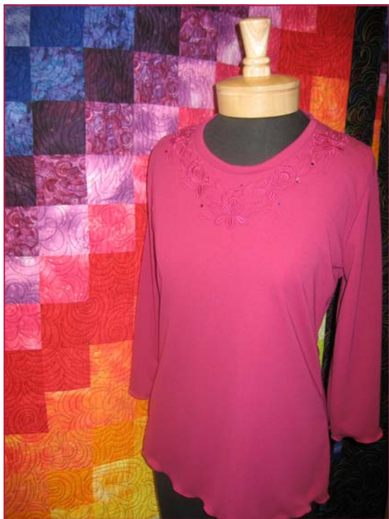
My Label T-shirt with Embroidery