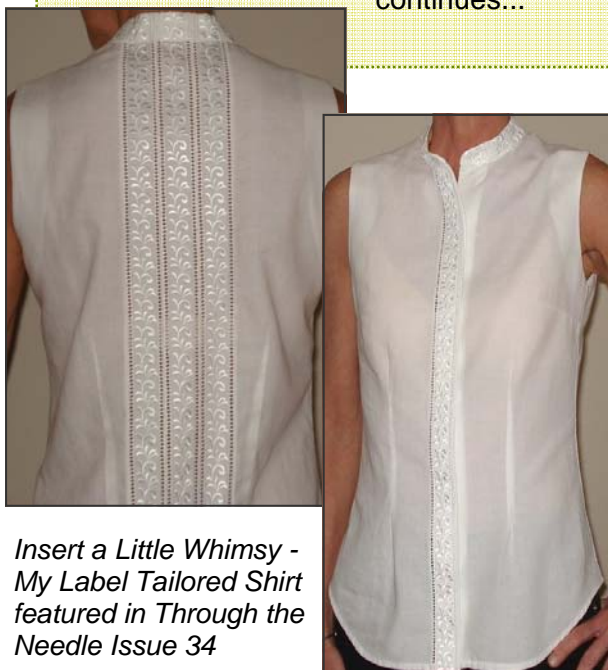
Insert a Little Whimsy - My Label Tailored Shirt featured in Through the Needle Issue 34

My advice for a newcomer into the sewing and textile world would be to remove "can't" from your vocabulary! Yes, you can do what you set your mind to! Try new things, surround yourself with those who aren't afraid of stepping outside the box and don't give up. I try not to make mistakes – but if I do, they become design opportunities!