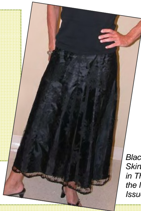
Black Lace Skirt featured in Through the Needle Issue 24