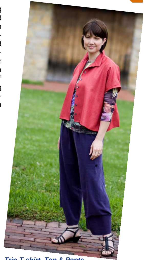
Trio T-shirt, Top & Pants Project Sewing Workshop Kits

I have had the opportunity to make the inaugural gowns for two female Kansas governors, Joan Finney and Kathleen Sebelius. The first of two gowns for Kathleen was a remake of a Geoffrey Beene custom-made dress commissioned by her mother 35 years ago to wear to Kathleen's father's inaugural ball as the new governor of the state of Ohio. Kathleen is larger than her mother and the silk faille fabric was brittle and delicate. To find extra fabric required disassembling the gown and coat and completely rebuilding it. I used and ruined eight different thimbles in the process. My middle finger will never be the same.