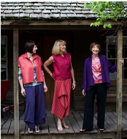
Center: Lotus Skirt with Mimosa Top Project Sewing Workshop Kits

My advice to the beginning sewer is to use the best fabric you can afford, read everything you can get your hands on, take classes forever, make a lot of mistakes, and own several good rippers. Perseverance is everything.