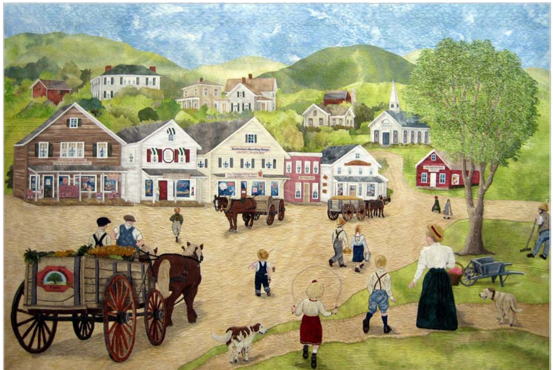
Life in Holly Ridge