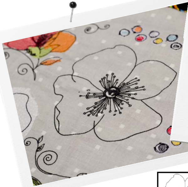
Bright (default) Colorway